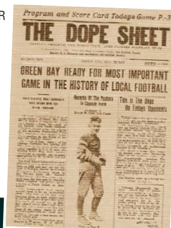
Two years after he co-founded the Packers with Curly Lambeau, George Calhoun began writing a piece called The Dope Sheet, which served as the official press release and game program from 1921-24.

ALL PRACTICES CLOSED TO PUBLIC FOR REMAINDER OF SEASON